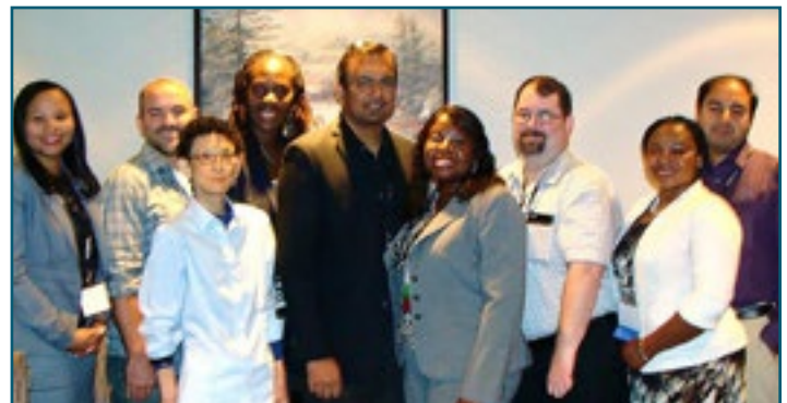
MAC Officers 2014 - 2015