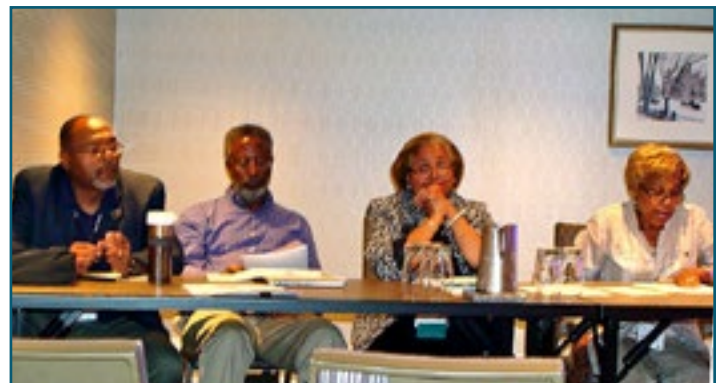
Montreal panel on the impact of the Brown decision.

Last year, the most common reason for not participating was that people were too busy. Believe me, I understand that—between research, teaching, and service, there is always something. But this is a small commitment in terms of time, and it makes a huge impact. I look forward to your participation. Contact me at jgrimm@lsu.edu to volunteer.