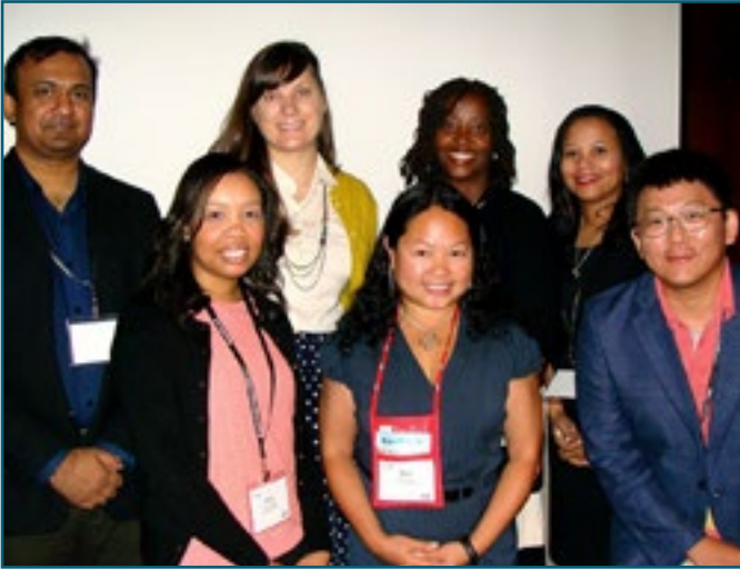
MACers at Conference Session