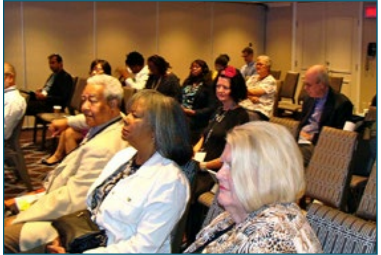
Panel Session Attendees